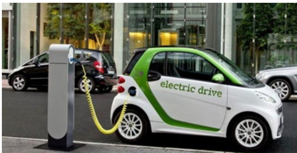
The self-government of the

Entities with foreign capital serve a significant function in the process of building and strengthening economic potential. As far as the type of economic activity is concerned, entities representing the following branches: trade, repair of motor vehicles, industrial processing, professional, scientific and technical activities, construction and real estate market services are the most numerous group.