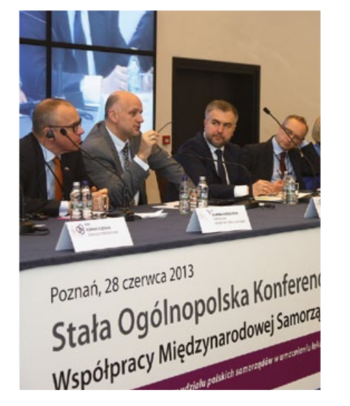
will indirectly enrich the potential of activities of Polish local self-governments.

This also means that we will have an area of cooperation connected with the functioning of various groups within Polish local self-governments. I refer here first of all to those directly neighbouring on Belarus, where we deal with the activity of groups which cannot operate within their own country. I mean here first of all Belarus democratic opposition. Many representatives of this opposition movement are active e.g. in Bialystok. They will obtain support from the European Endowment for Democracy and therefore the burden of care over them, currently borne in large measure by local authorities, will be slightly reduced. In other words, the Endowment funds allocated directly to the Eastern Partnership states